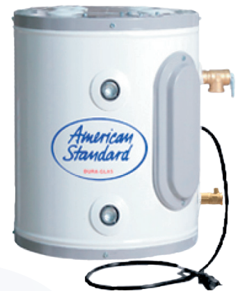
Model CE-2 ½-AS

2 ½, 6, 12, & 20 Gallon Capacities 120, 208, or 240 V Single Phase Up to 6,000 Watts Power