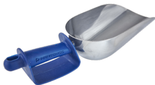
K00463 - NSF Metal Scoop