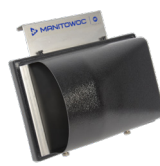
K00461 - NSF External Scoop Holder