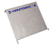
K00482 - Hanger (required with K00461)