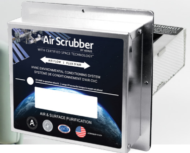
New Patented Cell Design