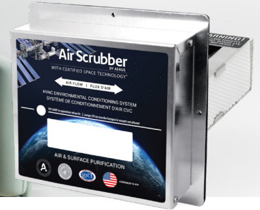
New Patented Cell Design