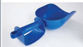
Ergonomic NSF approved sanitary ice scoop included