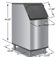
D420 383 lbs. (174 kgs)