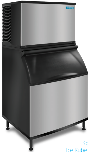
Koolaire KT-0300 Ice Kube Machine on K400 Bin

Koolaire by Manitowoc ice machines are designed, developed and tested by Manitowoc engineers to provide great ice production, energy efficiency and reliable service at an affordable price.