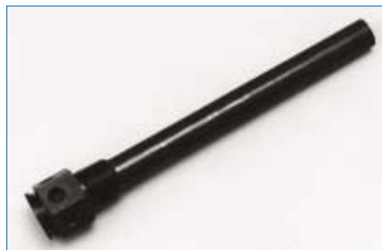
Heater well 030-018x-00 (Note: Heater wells are sold separately.)