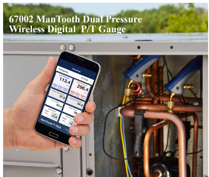
67002 ManTooth Dual Pressure Wireless Digital P/T Gauge