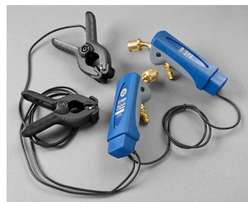
67002 ManTooth Dual Pressure Wireless Digital P/T Gauge

comes with a P/T module, tether unit and two temperature probe clamps. This unit also includes a convenient carrying case which can be purchased separately for the single pressure unit.