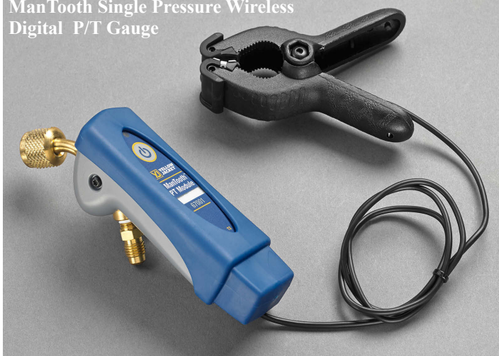
67001 ManTooth Single Pressure Wireless Digital P/T Gauge

The YELLOW JACKET® ManTooth™ Single Pressure Wireless Digital P/T Gauge (Part #67001, shown at left) includes a single hardware device and clamp.