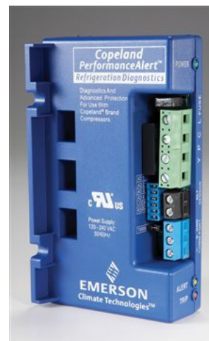
Figure 1: Copeland PerformanceAlert™

The Copeland PerformanceAlert diagnostics module is a breakthrough innovation for troubleshooting refrigeration system faults. By monitoring and analyzing data from Copeland® brand compressors, the Copeland PerformanceAlert module can accurately detect the cause of electrical and system related issues. When an issue occurs, the Copeland PerformanceAlert communicates an alert through a flashing LED indicator on the module and through modbus communication, guiding the service technician to identify the root cause of a problem quickly and accurately. The module can be applied in many refrigeration applications such as supermarket racks, walk-ins and industrial refrigeration.