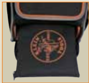
Removable zipper bag designed to fit compartment underneath.