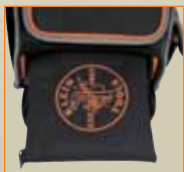
Removable zipper bag designed to fit compartment underneath.