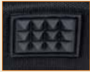
Rubber feet protect the bottom surface from the elements.