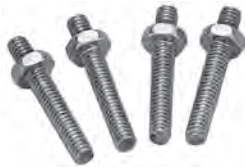
STOCK NO. 2087A MOUNTING STUDS 10-32 X 1" 4 per set (available separately)