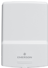
Sold Separately See page E