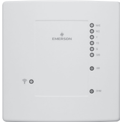
Equipment Control Module