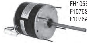
FH1056, FH1054, F1076S, FS1076S, F1076A, FH1076