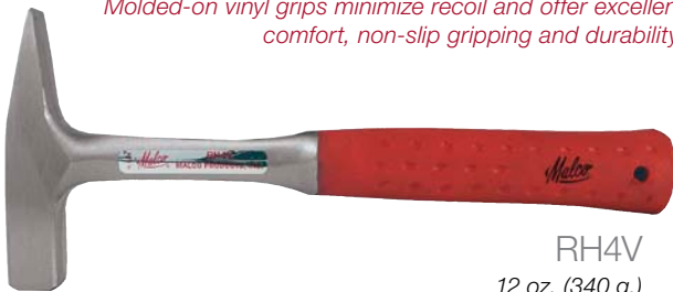
RH4V 12 oz. (340 g.)

Molded-on vinyl grips minimize recoil and offer excellent comfort, non-slip gripping and durability.