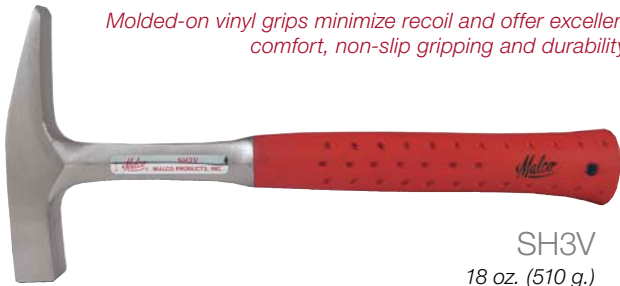
SH3V 18 oz. (510 g.)

Molded-on vinyl grips minimize recoil and offer excellent comfort, non-slip gripping and durability.