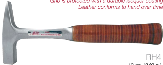
RH4 12 oz. (340 g.)

Grip is protected with a durable lacquer coating. Leather conforms to hand over time.