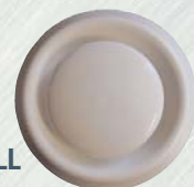
EXHAUST & SUPPLY GRILL