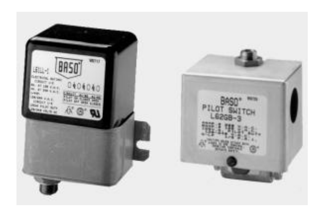
Figure 1: L61 and L62 Safety Shutoff Devices

In Non-100% shutoff models L61LL and L62AA applications, if the pilot flame is extinguished, the switch will interrupt gas flow to the main burner only, shutting down the appliance. Pilot gas will continue to flow until the pilot gas is manually shut off.