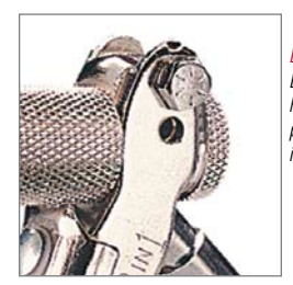
LONG STROKE Bolt in upper hole for easy pulling rivets in one pull.

(see specifications column below). 2-in-1 adjustment features a single long stroke for most hand riveting applications and a short "ratchet action" power stroke for setting larger diameter rivets. Outside jaw-grip adjustment wheel opens and closes jaws with fingertip ease to fit any size mandrel and to obtain maximum stroke efficiency. Professional slim nose allows 2-in-1 to go where other hand riveters cannot. Ideal for reaching into corners and recessed areas. Three nosepieces 1/8", 5/32" and 3/16" included with tool. Nosepieces are stored in handle. Heavy duty all steel construction insures long life and minimum wear. Polished finish, nickel-chrome plated. Red vinyl cushion grip and hand stop.