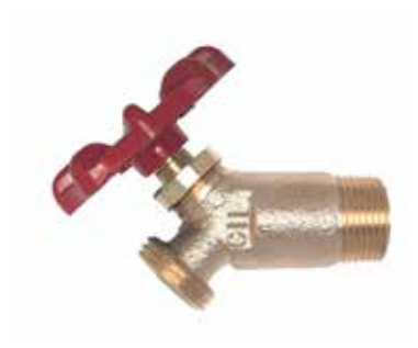
31-600 Male NPT